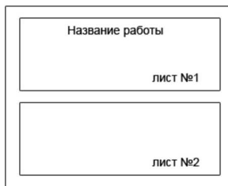
2 A1 sheets placement